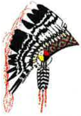
Assembly of Manitoba Chiefs